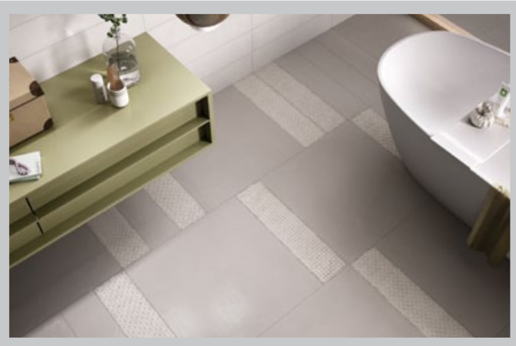
Installation: Manufacturer recommends on-set (stacked) pattern like the photo above. If a staggered pattern is preferred, tile should overlap no more than 20%. Use a high bond, property thin set. Tiles are non-rectified. Allow a min. 1/16″ grout joint. Use of leveling piece such as Tuscan Seamclip™.

Application: Suitable for residential and commercial use.