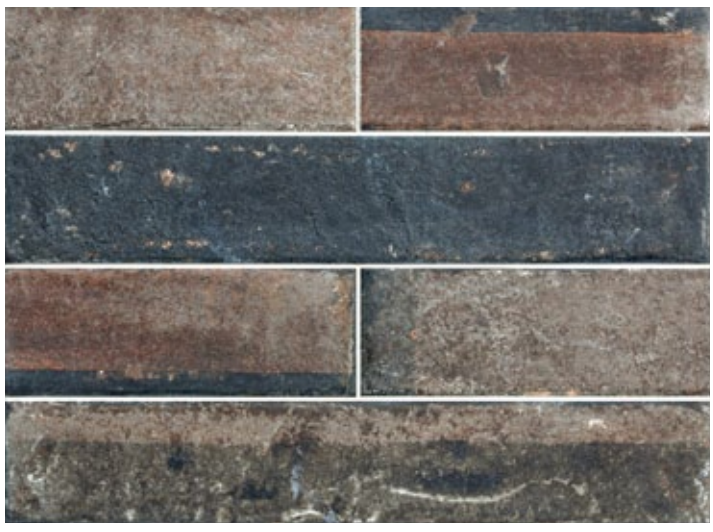
3" x 16"