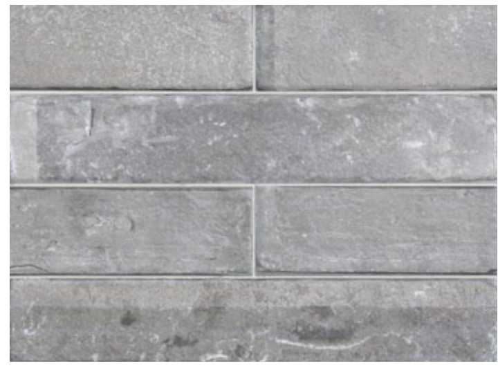
3" x 16"