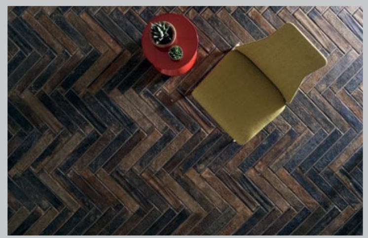
Variation: V3 (Moderate). Ensure a dry layout and necessary blending for owner's/buyer's approval before setting.

Installation: Use a high bond property quality brand thin set and follow the instructions set forth by TCNA for porcelain tile. Tiles are non-rectified. Allow a min. 1/16" grout joint.