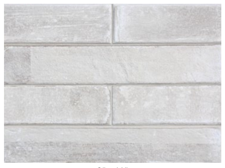
3" x 16"

3" \times 16" Surface Bullnose pieces are made to order with 8 to 12 days lead time.